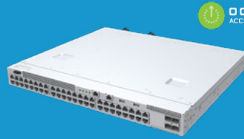
DS1000 1U 48-port 1GbE Access Switch

Open infrastructure platforms for future-ready data centers