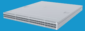
DS2000 1U 48-port 10GbE/25GbE Data Center Switch