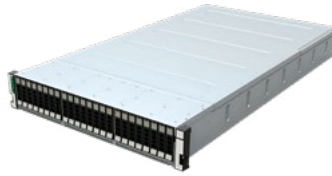
SC4200 (Athena G2) 2U All-Flash PCIe® 4.0 Gen 4 Dual Storage Controller