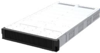
SC6100 2U All-Flash PCIe® Gen 5 Storage Controller

Next-generation, cloud-optimized data storage solutions