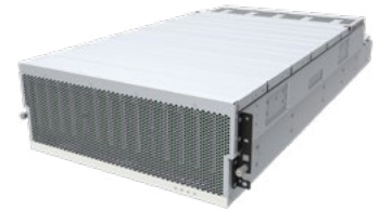
SD6200 (Titan G2) 4U High-Density Storage Enclosure