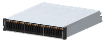
SE4200 (Nebula G2) 2U All-Flash PCIe® 4.0 Expansion Storage System