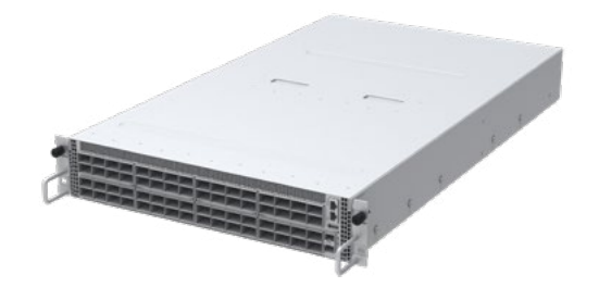
DS5000 2U 64-port 800GbE Data Center Switch

Transforming connectivity for the future with unprecedented speed and agility