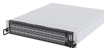
DS3001 2U 64-Port 100GbE Data Center Switch