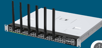
EG1050 1U 48-port 1GbE / 2.5GbE (PoE) Edge Gateway with Wi-Fi and 5G