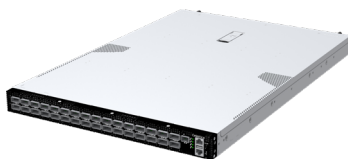
DS4000 / DS4001 1U 32-port 400GbE Data Center Switch

Performance, flexibility and efficiency to fit your unique applications