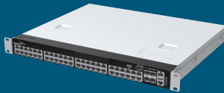
ES1010 / ES1050 1U 48-port 1GbE / 2.5GbE (PoE) Access Switches