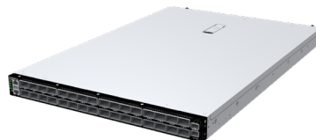
DS4101 1U 32-port 800G Data Center Switch