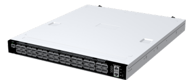
DS3000 1U 32-port 100GbE Data Center Switch