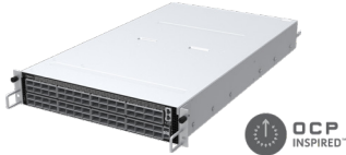
DS5000 2U 64-port 800GbE Data Center Switch