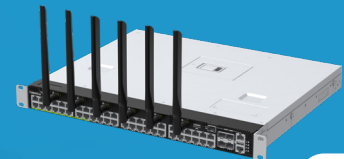
EG1050 1U 48-port 1GbE / 2.5GbE (PoE) Edge Gateway with Wi-Fi and 5G