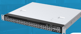
ES1010 / ES1050 1U 48-port 1GbE / 2.5GbE (PoE) Access Switches