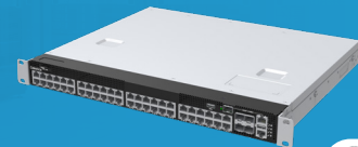
ES1000 1U 24 / 48-port 1GbE (PoE) Access Switch