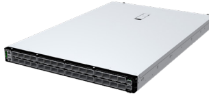
DS4101 1U 32-port 800G Data Center Switch