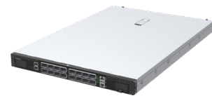
DS4100 1U 16-port 800G Data Center Switch