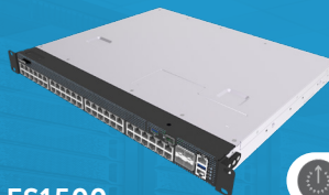
ES1500 1U 8 / 24 / 48-port 2.5GbE (PoE) Campus Access Switch